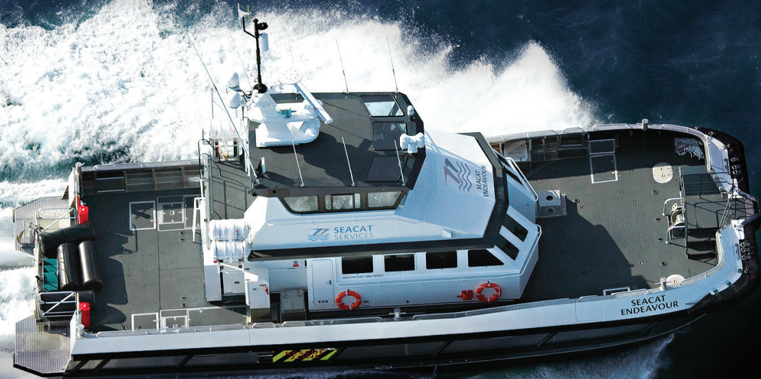
SEACAT ENDEAVOUR Built by South Boats MJP UJ 575

When you make the decision to trust MJP to propel your livelihood, the team is available to you every day for the lifetime of ownership. Whether you call with a maintenance question, need hands-on personal training, or find you would like to make adjustments to your control system, we value the chance to connect with you and hear all about your travels. At MJP, you have become a member of our extended family and we are here for you every step of your voyage.